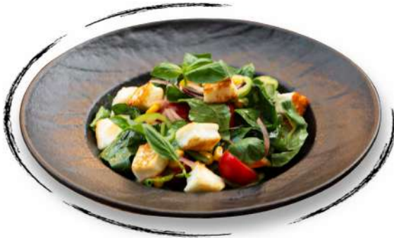
• SALAD WITH HALLOUMI CHEESE