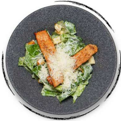
CAESAR WITH FISH AMD 3800