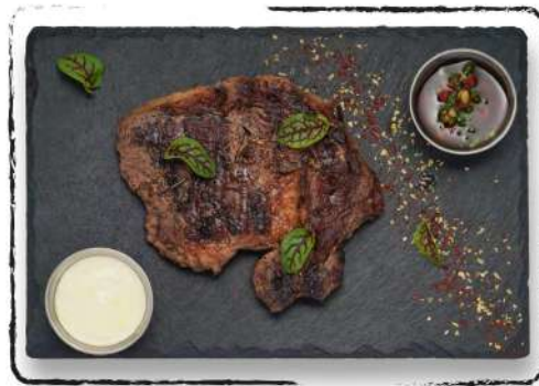
STEAK RIBEYE (400 GR) AMD 18000