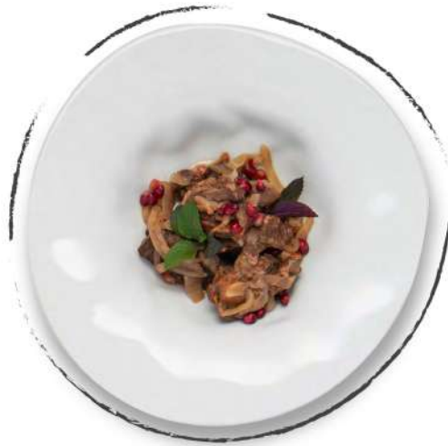
LAMB SHANK WITH BALSAMIC SAUCE