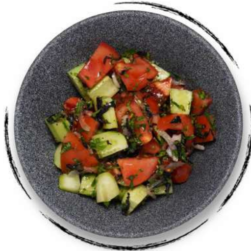
TOMATOES AND CUCUMBERS AMD 2400