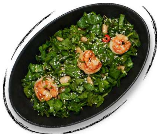
"ADANA" SHRIMP SALAD AMD 5000