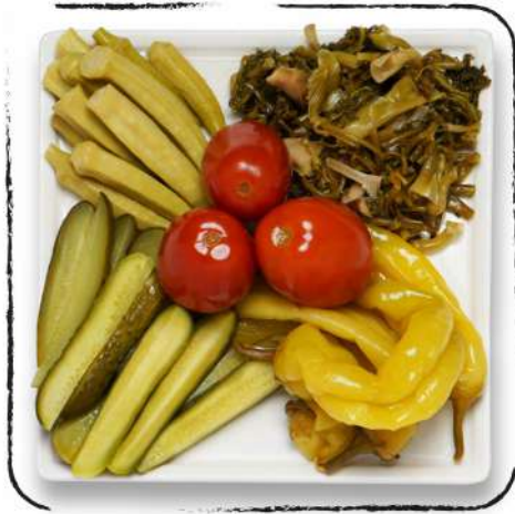
● ASSORTED PICKLES/ MARINADES AMD 2700