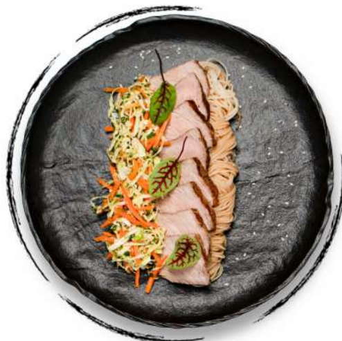
FILET MIGNON WITH RICE NOODLES AMD 5500