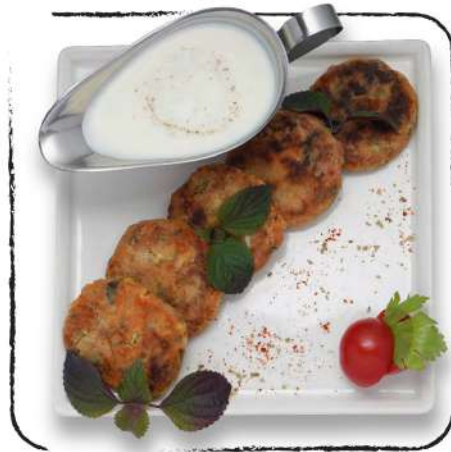
● PAN FRIED APRICOT NUT ROLLS AMD 2600