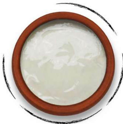
VILLAGE SOUR CREAM AMD 2200