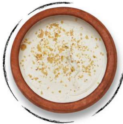
DRAINED MATSUN AMD 2000