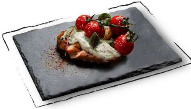
CHICKEN GRILL WITH CHEESE SAUCE AMD 5000