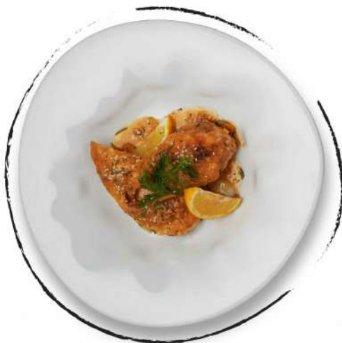
CHICKEN BREAST IN LEMON SAUCE