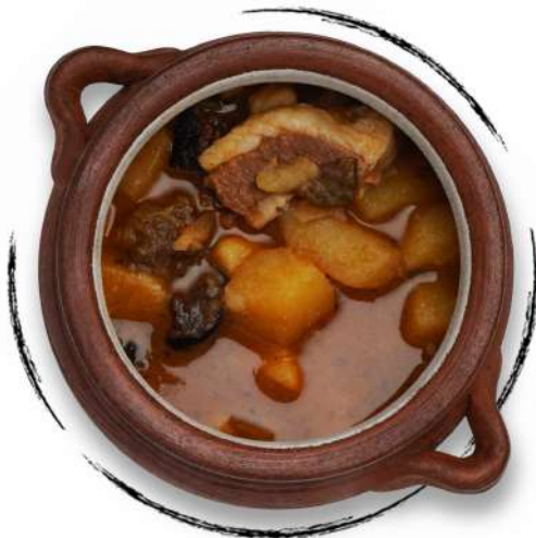
PITI SOUP WITH LAMB