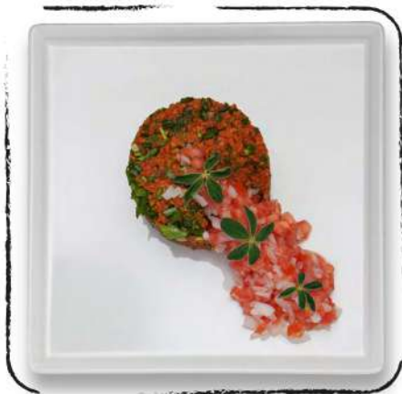
● EETCH AMD 2600