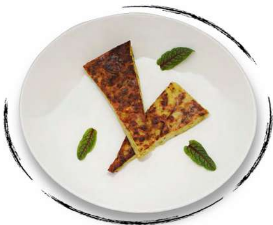
• ZUCCHINI PATTIES AMD 2300