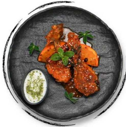
CHICKEN IN SPICY ORANGE SAUCE